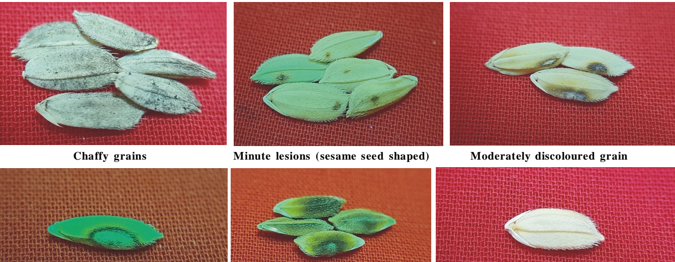
Sporulation in grains

The FT-IR spectrum of healthy, moderately and