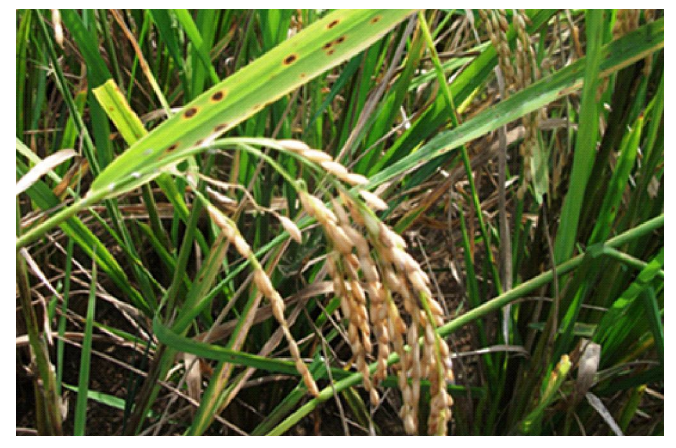
Plate 1 : Rice brown leaf spot symptoms.