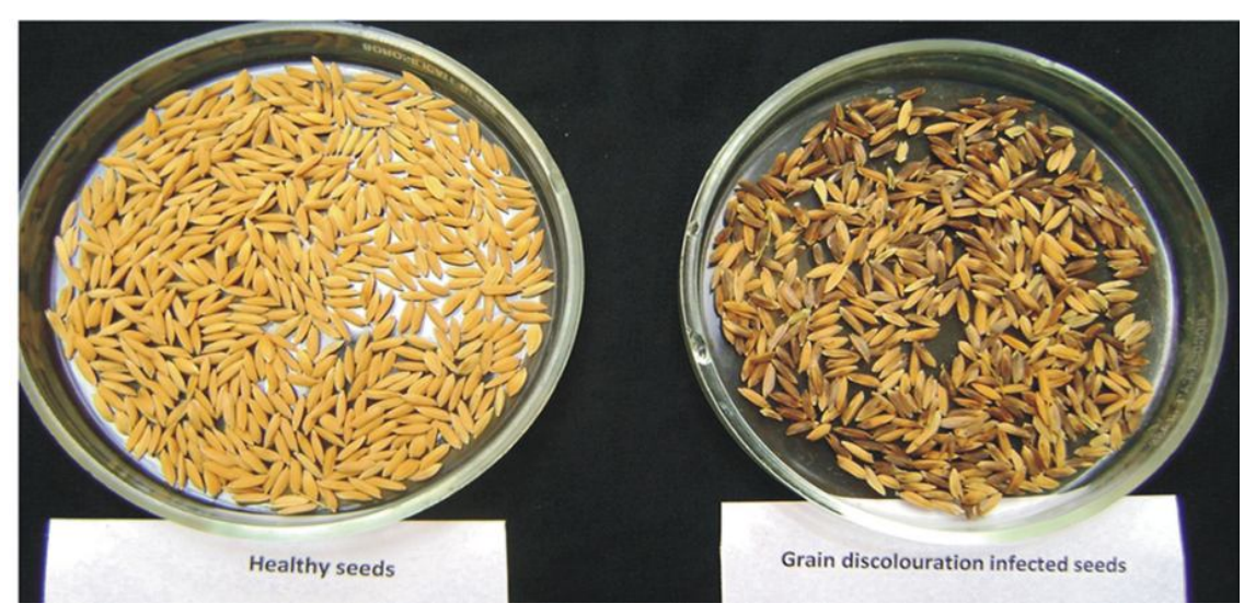
Plate 3: Symptoms on grains.